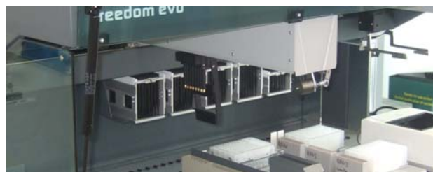
Fig 3 Safety: the lower DiTi eject option enables smooth dropping of used disposable tips directly into the waste. The risk of splashing remaining liquid droplets while dropping the tips from the tip adapters is avoided.

Fig 2 Flexibility of the Freedom EVO platform: sample loading section. Depending on the sample preparation required, serum can be pre-diluted in a deep-well plate prepared in the serology department. As shown on the image, starting samples might be prepared in Eppendorf tubes. Alternatively, regular blood tubes can also be loaded on the worktable using the dedicated rack (not shown on the image).