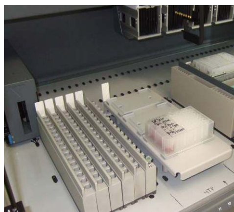
Fig 2 Flexibility of the Freedom EVO platform: sample loading section. Depending on the sample preparation required, serum can be pre-diluted in a deep-well plate prepared in the serology department. As shown on the image, starting samples might be prepared in Eppendorf tubes. Alternatively, regular blood tubes can also be loaded on the worktable using the dedicated rack (not shown on the image).

Subsequent detection of the specific RNA segment of the virus is tested by reverse transcription and real-time PCR. The platform can be easily adapted for RNA preparations of other viruses and is fully compatible with a variety of labware, including Eppendorf ® tubes, deep-well plates and blood tubes (see Fig 2); it is currently used to detect avian influenza, bluetongue and classical swine fever viruses.