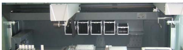
Fig 4 Additional storage places for consumables save space on the worktable. The flexible number and size of shelves allow initial loading of necessary consumables such as DiTi box carriers, microplates and deep-well plates to reduce operator actions during processing.

Whole blood samples (with added EDTA) arrive at the CVUA-RRW's serology department where they are labeled with barcodes and entered into the laboratory information system (LIS). The serology department carries out ELISAs on all the samples to detect viral antibodies, using automated ELISA processor from Tecan. In addition, each sample is distributed into a deep-well plate and diluted (1:1) with PBS. These samples are delivered to the molecular biology department for RNA preparation using the Freedom EVO 150 workstation followed by qualitative PCR assays.