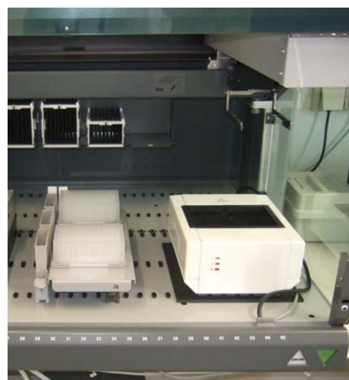
Fig 5 Complete process automation. The diluted serum is pipetted into the deep-well plate and lysis buffer is added. The lysis can be carried out on the worktable at room temperature or in a heated incubator. Here a third party microplate incubator from Biostep, GmbH (Jahnsdorf, Germany) was integrated to reduce manual sample handling and to increase the workflow efficiency.

The viral RNA extraction procedure is carried out using the NucleoSpin ® 96 Virus kit, according to the manufacturer's manual [Macherey-Nagel] and the Friedrich-Loeffler Institute's protocol, with minor modifications as follows: the sample lysis is performed directly on the Freedom EVO's worktable (see Fig 5), an extra ethanol wash step followed by drying for 20 minutes allows better recovery and quality of RNA. Additionally, the final elution of RNA is done by centrifugation in order to obtain higher concentrated viral RNA. RNA preparations are used immediately for qualitative real-time PCR, according to the protocol provided by the Friedrich-Loeffler Institute.