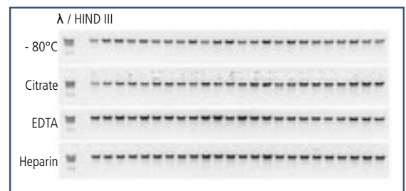
Figure 1: A total of 96 isolated genomic DNA samples with the NucleoSpin® 96 Blood kit from differently stabilized and stored blood samples. 10µl of 200µl eluted gDNA from each sample were separated by electrophoresis on 1.0% agarose gel for qualitative comparison. The results obtained are very homogenous, independently of the procedure used for storing the blood samples.

The MICROLAB® STAR is validated for the automation of the MACHEREY-NAGEL NucleoSpin® 96 Blood kit. The validated system includes the instrument, the labware carriers and the software. The user is only required to load and unload the labware carriers.