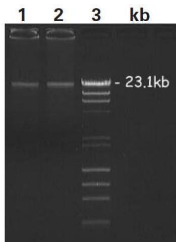
Figure 2. Examples of genomic DNA purified using the NucleoSpin Tissue Kit. Lanes 1 & 2: purified genomic DNA. Lane 3: DNA markers.