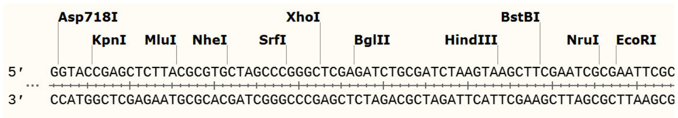
Figure 1. pSEAP2-Basic Vector map and cloning site.

Takara Bio USA, Inc. 1290 Terra Bella Avenue, Mountain View, CA 94043, USA U.S. Technical Support: techUS@takarabio.com