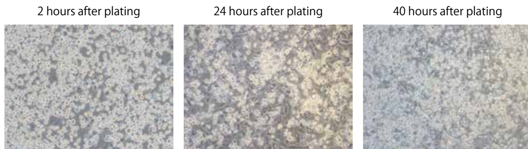
Figure 2. Cell morphology of cardiomyocytes

Note: Beating of cardiomyocytes sometimes temporarily stops after a medium change.