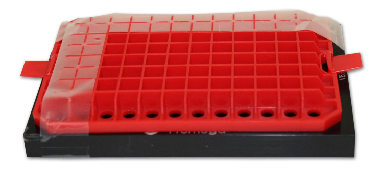
Figure 1. Setup for positioning 0.2 ml tubes containing first-strand cDNA on a MagnaBot II Magnetic Separator.

As seen in Figure 1, you may place the tubes in the top part of an inverted P20 or P200 Rainin Tip Holder which is taped to a MagnaBot II Magnetic Separator (Promega Part No. V8351)